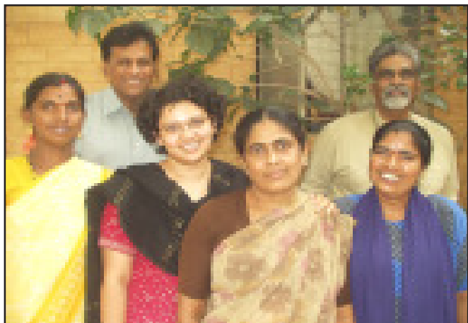
The Bandhavi Team

Visthar are committed to the Bandhavi project as we see it as a practical expression of our ongoing campaign on violence against women. In similar vein we are deeply committed to alternative education which we hope to undertake through the Samagra Shikshana Shaale for the children of Bandhavi and school dropouts from the neighbouring villages. Besides dedicating part of our buildings to the project we wish to ensure our ongoing support to the staff at Bandhavi and Samagra Shikshana Shaale.