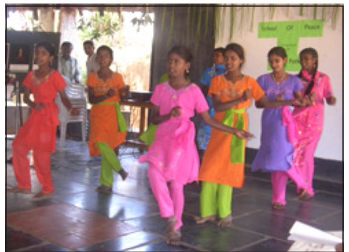
Performing at the School of Peace inaugural