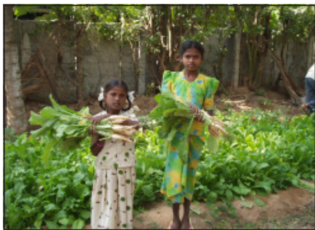
Children with the fruit of their labour