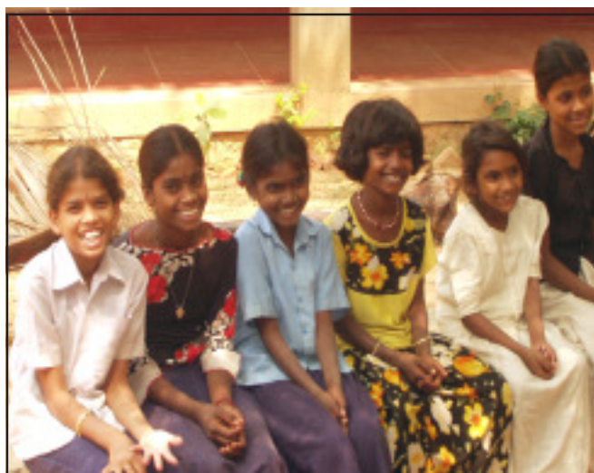
Relaxing after lunch