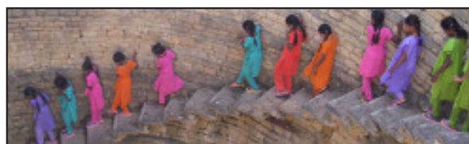
Going into our own wells

The Bandhavi children amazed, and pulled at our heart strings as they participated in song, dance and drama at the women’s day celebration at Visthar. Reflecting on the theme Breaking Barriers, Building Communities , the children painted, made clay models, and performed. Responses were quick as they were asked how they would protect the seeds of freedom and creativity that were planted in the drama. Their spontaneity and enthusiasm in the activities, and their fearlessness descending a deep dry well, left all who participated proud to be associated with them.