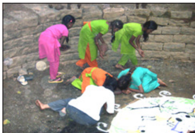
Nurturing seeds of freedom and creativity