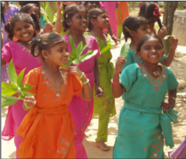
Celebrating Ugadi at Bandhavi

We understand the financial implications of such a project and negotiations are underway with Concern India Foundation, Infosys Foundation, ING Vysya Foundation, and Kinder Not Hilfe (KNH). In the meantime we have launched the project with loans, advances and gifts from individuals and organisations.