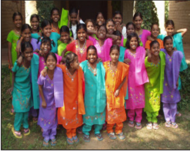
Our smiling 35!