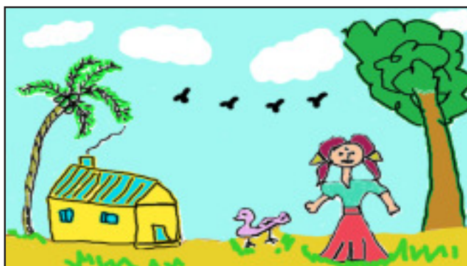
Rajeshwari's picture of her village